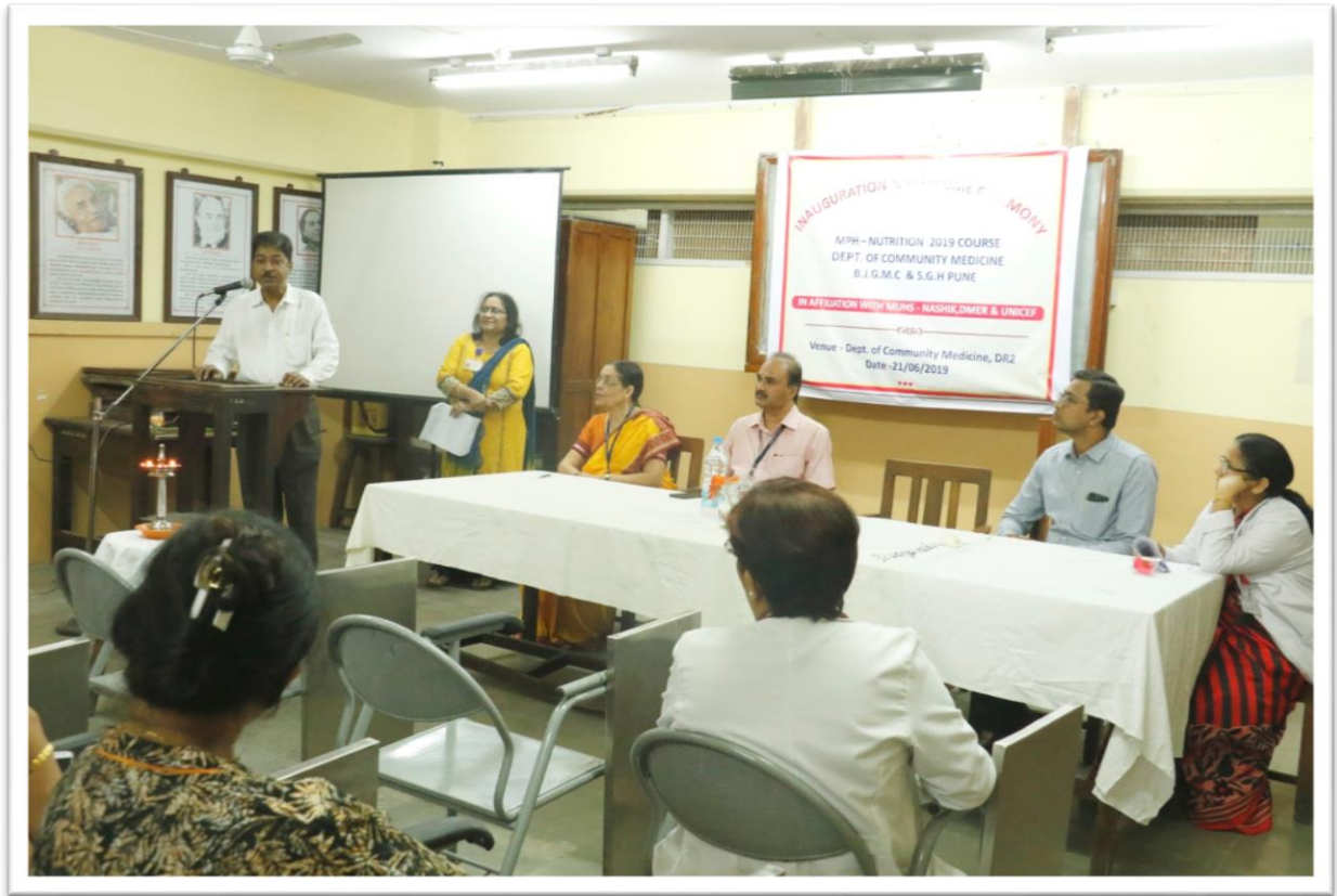
Inauguration of First batch of MPH (Nutrition) Course on 21-06-2019